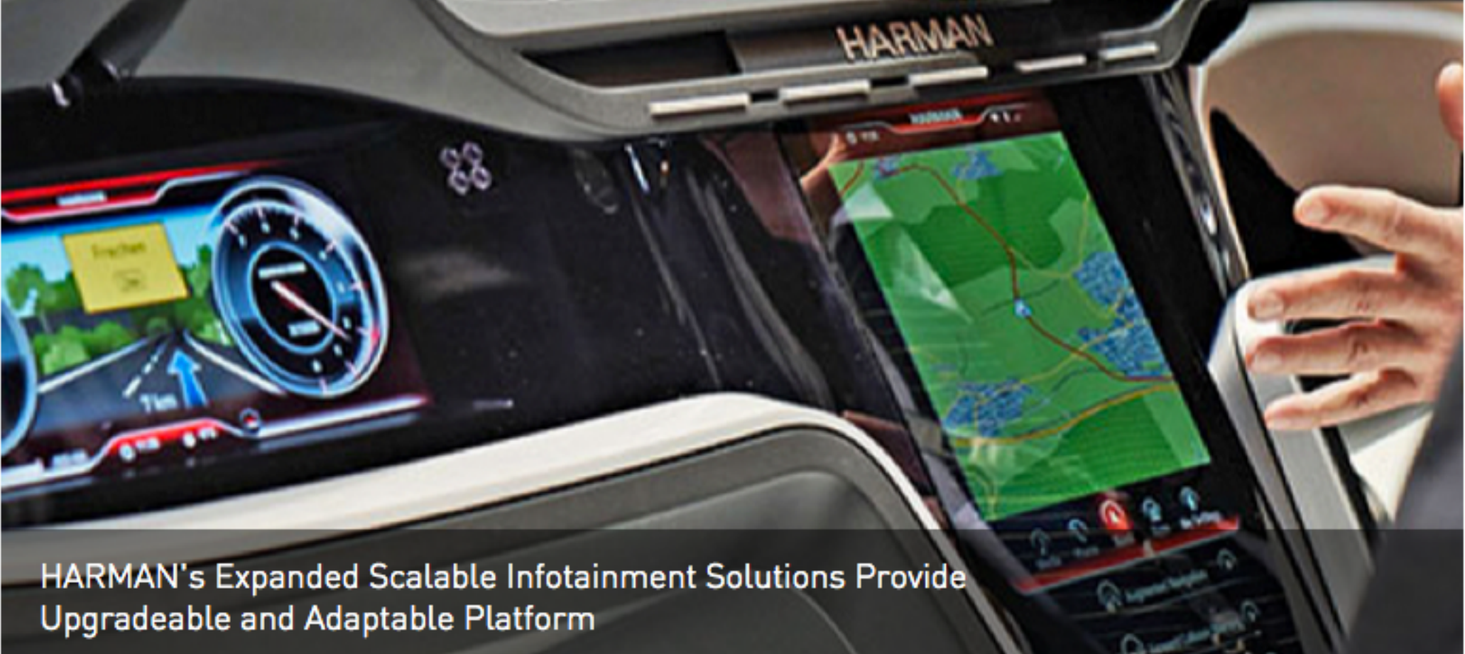
HARMAN's Expanded Scalable Infotainment Solutions Provide Upgradeable and Adaptable Platform