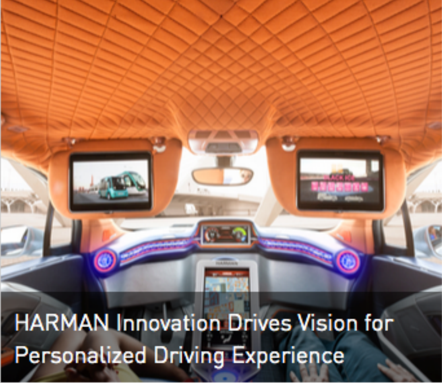
HARMAN Innovation Drives Vision for Personalized Driving Experience