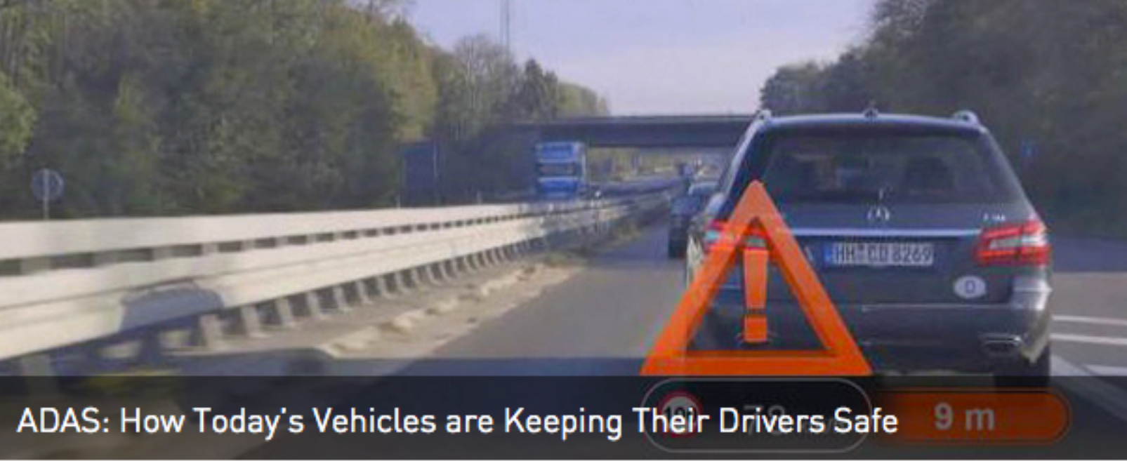
ADAS: How Today's Vehicles are Keeping Their Drivers Safe 9 m