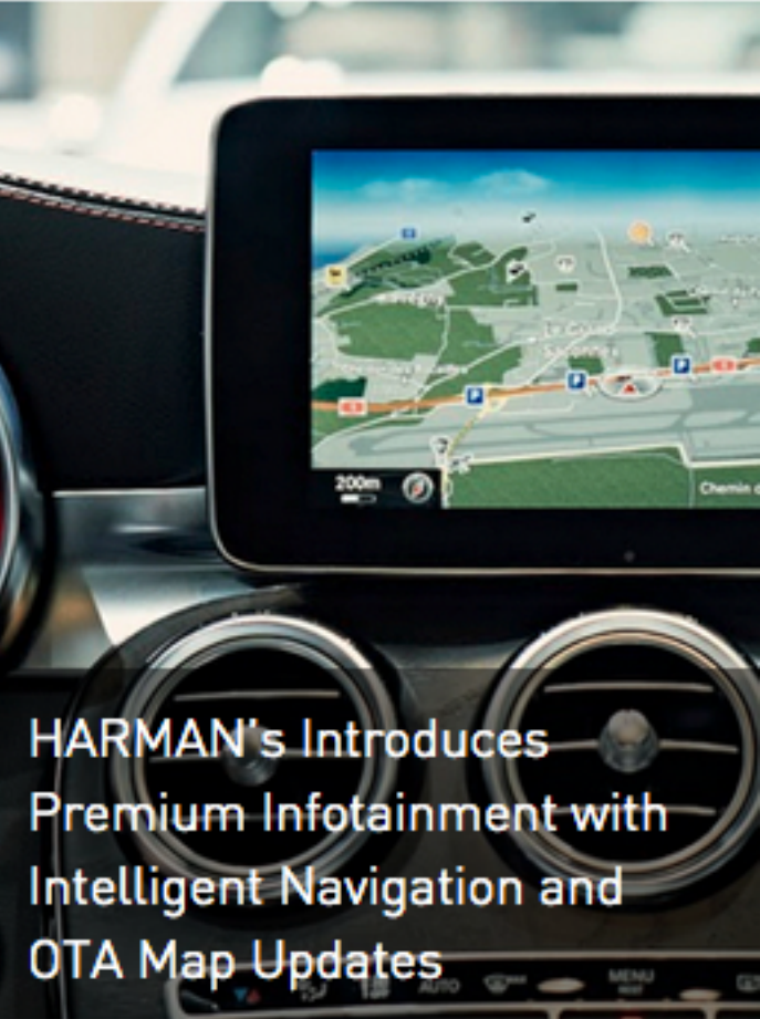
HARMAN's Introduces Premium Infotainment with Intelligent Navigation and OTA Map Updates