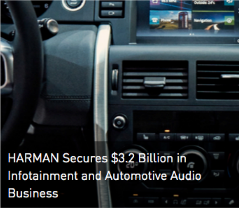
HARMAN Secures $3.2 Billion in Infotainment and Automotive Audio Business